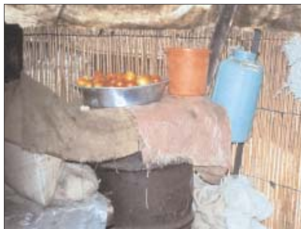
A Bedouin kitchen inside a tent.

Nephi described the afflictions the family suffered, including hunger, thirst, and fatigue. In one remarkable entry, he wrote that they had to eat their meat raw, probably to avoid exposing themselves to danger by lighting a fire and thereby attracting the attention of marauders (see 1 Nephi 17:2, 12). These trials and difficulties underscore a sharp Middle Eastern demographical division between city dwellers and nomads. I imagine that Lehi and his