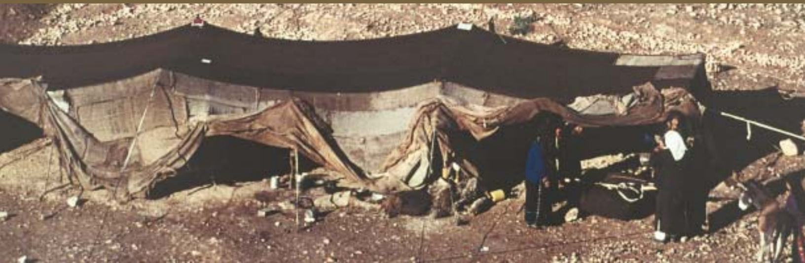
A Bedouin tent contrasted with the modern, bustling city of Nazareth.